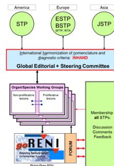
Diagram of INHAND Structure and Process

• 5 non-rodent species working groups: dog, monkey, minipig, rabbit and fish • New group formed to address terminology in non-rodent ocular toxicity studies • Each group is composed of expert toxicologic pathologists from each of the participating societies responsible for developing preferred nomenclature and diagnostic criteria.